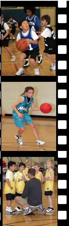
PYC Winter League Sports Clips