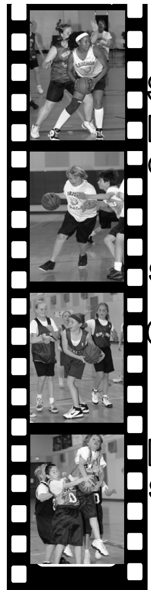
PYC Winter League Sports Clips